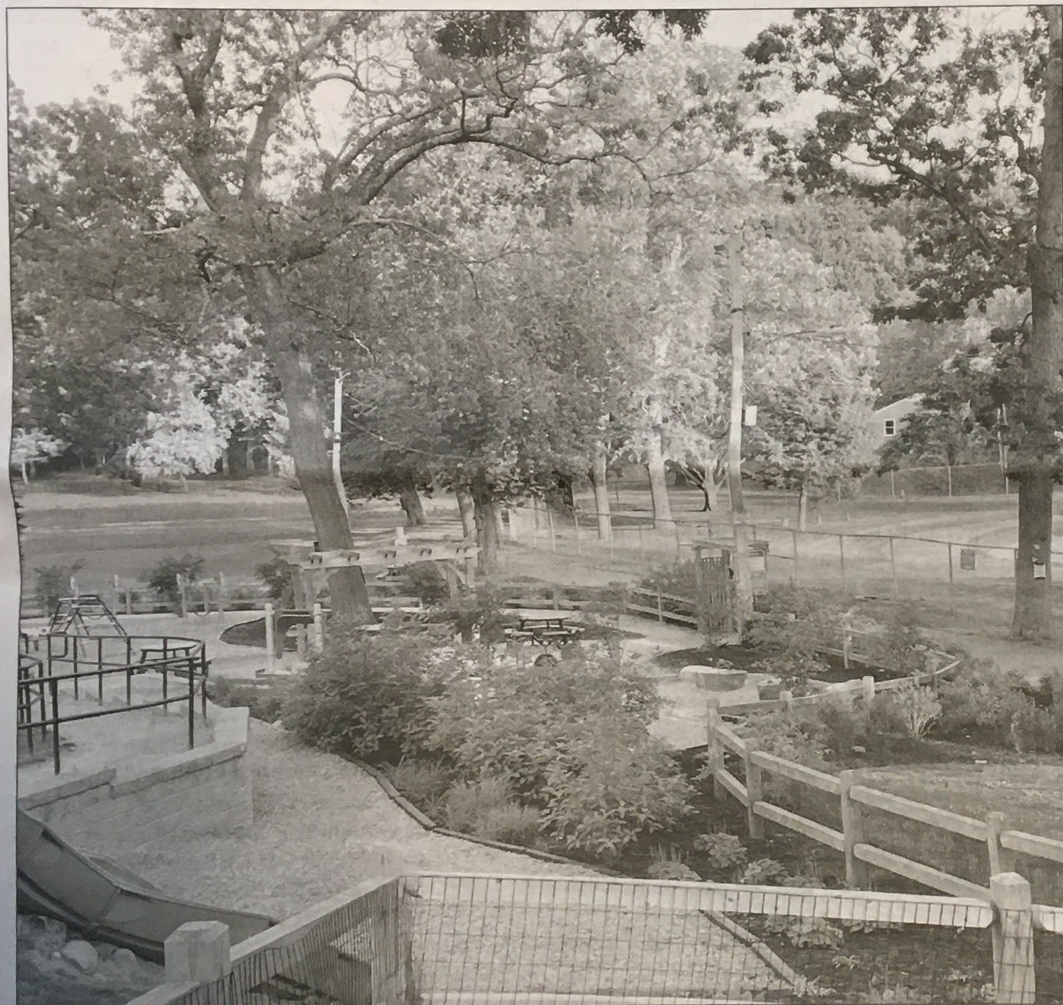
A view of the new play area at Cunningham Park which will be dedicated June 11.

For more information about the Coghlan Play Garden festivities, visit www.cunninghampark.org .